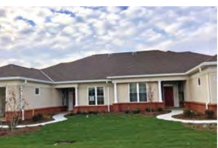
Pictured are the exteriors of a Lancaster (top) and Jefferson (bottom) villa in Hedera Place.